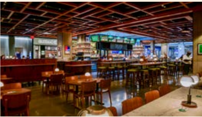
PEARSE & HEUSTON