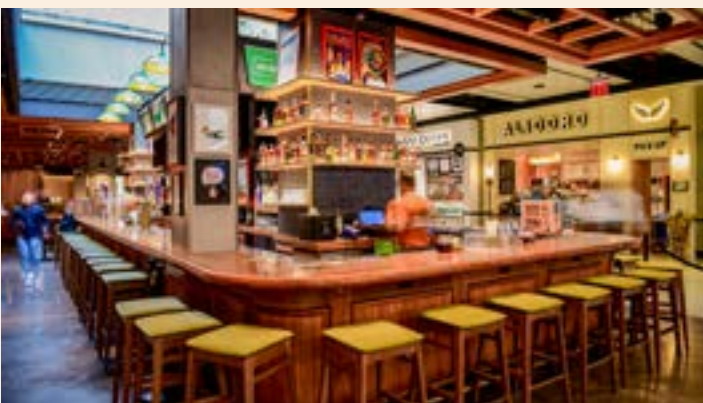
GRAND CANAL BAR