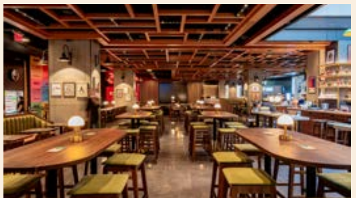
PEARSE, HEUSTON, LANYON