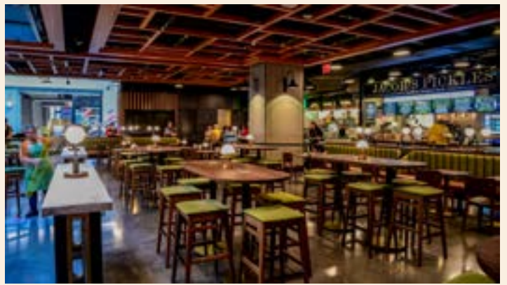
HEUSTON & LANYON